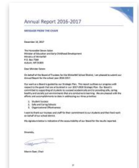
Reports and Letters to Parents